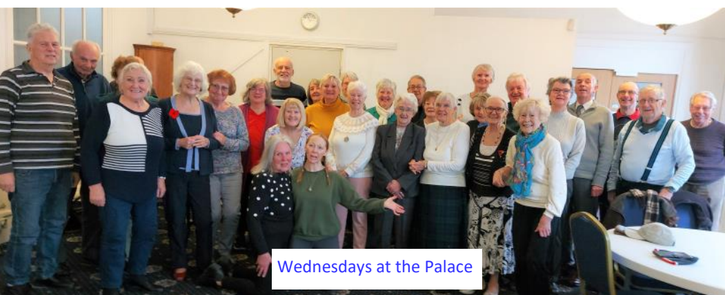
Wednesdays at the Palace

Obviously the weather dependent outdoor get-togethers are mostly on hold until the Spring but there are other occasions when we meet up which tend to be spontaneous meetings so do keep an eye on any notices at meetings or in the Newsletter.