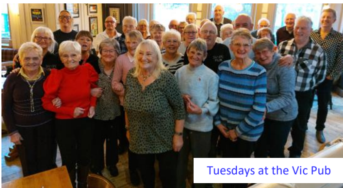
Tuesdays at the Vic Pub

We have such lovely gatherings during each week. The ones pictured here are the regular ones and Sunday Lunches take place at various venues which are currently either The Clifton Hotel or The Water's Edge.