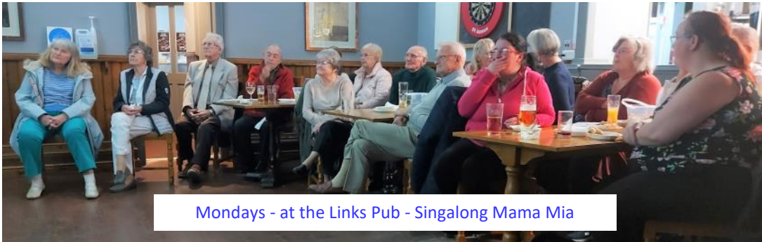
Mondays - at the Links Pub - Singalong Mama Mia