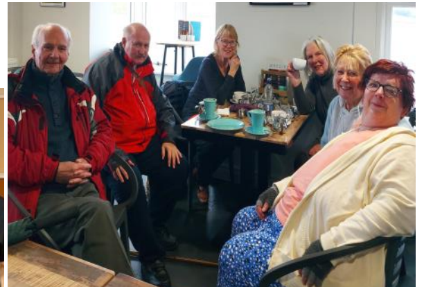
April 2024 - A welcome cuppa having just completed a Fitness Walk round Fairhaven Lake