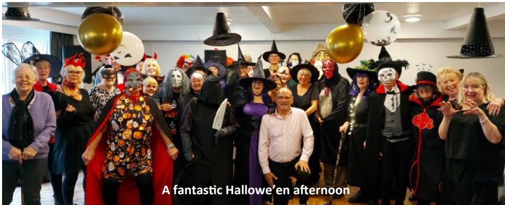
A fantastic Hallowe'en afternoon