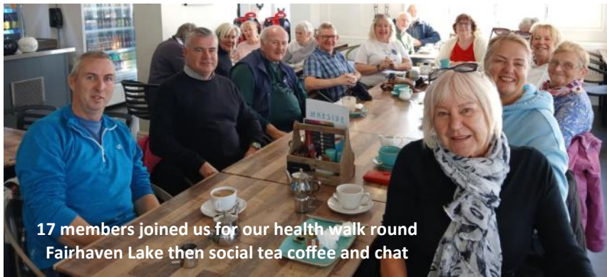
17 members joined us for our health walk round Fairhaven Lake then social tea coffee and chat