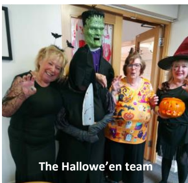
The Hallowe'en team