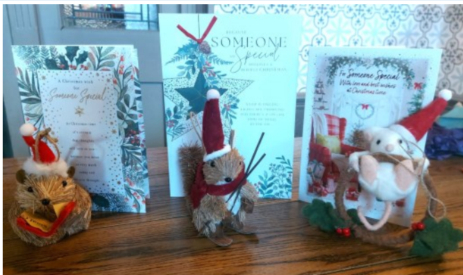
Love & kindness at Christmas from a lovely member