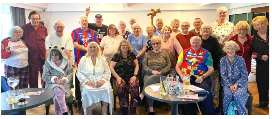
Pyjama Party Group - more pictures inside